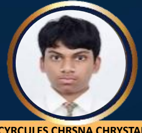
CYRCULES CHRSNA CHRYSTAL (AGG -93.4%)